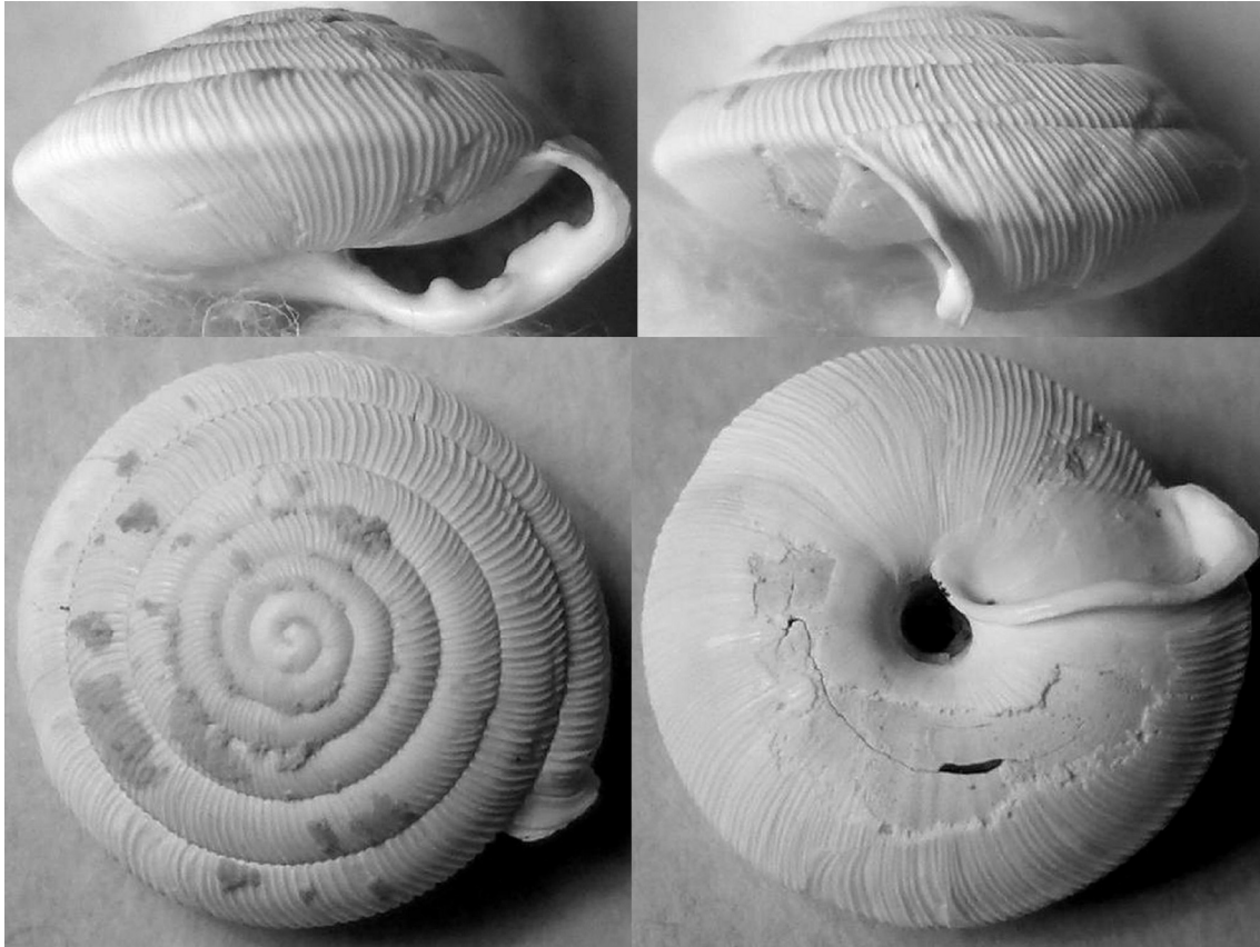
Figure 1. Holotype (MZB 84–6550A) of Darderia bellverica Altaba, 2007. Maximum diameter: 10.1 mm.

signed by one of the authors of Oestophora cuerdaei . Third, Darderia bellverica was included in the catalog of Beckmann (2007: p. 91), together with an indication that another “ Oestophora sp. ind.” would be described in the future by Quintana, Vicens and Pons. Beckmann’s book, to which Quintana himself contributed, was compiled in just a few months and published in July 2007, in a hurry due to the author’s terminal illness (as attested by the biography on p. 255, dated “den 8. Juni 2007”). On p. 68 of the same book it is stated that Quintana was working on another paper, which was finally published in the same Bolletí of the SHNB vol. 49 (Quintana, 2006, published in 2007), which was just started to be distributed after September. In summer, a pdf file of this paper circulated through the Internet, with no page numbers and a heading belonging to a monograph of the SHNB entitled “Quaternari i Geomorfologia. Homenatge a Joan Cuerda Barceló”. Such monograph was also cited by Vicens et al. (2006), but it was never published. Apparently a late decision was taken not to publish that monograph, including at least the paper